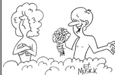
"Baby, you know you're the only woman for me."