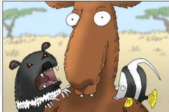
CONSCIENCE IN THE ANIMAL KINGDOM