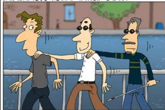
(See Luke 6:39)