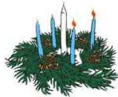
Second Sunday of Advent

On December 6, 2009 , the Second Sunday of Advent, representatives of our FPC Youth Groups will light the candle and present the readings to the congregation: